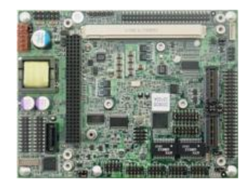
COM Express form-factor baseboard

In addition to these features, the COM Express form-factor baseboard adds four serial ports, RS-232/422/485 buffering, an AC'97 audio CODEC, digital I/O, a second gigabit Ethernet LAN interface, and flexible via stackable PCI-104 or SUMIT expansion and an on-board FeaturePak module socket.