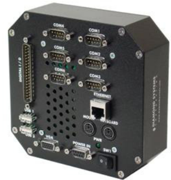
Octavio-RDS Embedded Application Server

Rhodeus supports Linux, Windows CE™ and Windows XP™, and Windows Embedded Standard™.